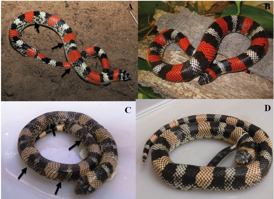
Figure 1. Comparison of Xenodon mattogrossensis and X. pulcher . Arrows point to white spots in the lateral side of black rings in X. mattogrossensis that are absent in X. pulcher . a) X. mattogrossensis , Fazenda Nhumirim, Corumbá, Mato Grosso do Sul; b) X. pulcher , Fazenda Patolá, Porto Murtinho, Mato Grosso do Sul; c) specimen of X. mattogrossensis (ZUFMS-REP 1516); d) specimen of X. pulcher (ZUFMS-REP 1003-CH290).

is high variation in our data and considerable overlap between the meristic characters of X. pulcher and X. mattogrossensis ; however X. mattogrossensis differs from X. pulcher and X. semicinctus in the presence of lateral white spots on the black rings (Scrocchi and Cruz, 1993), and the specimens from Porto Murtinho do not